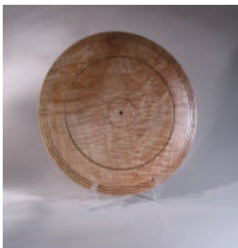
Maple Platter-Wayne Cunningham