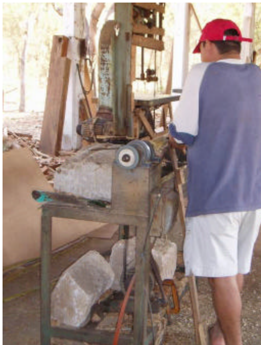
Universal tool rest in use. The turner requires a good arm to get the culls to the waste pile outside.