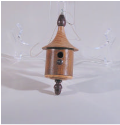
Mini Birdhouse-Roger Pitts