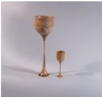
Thin Maple Goblets – Roger Pitts