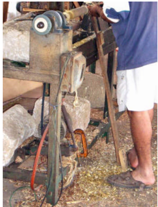
Hard toes required to work in this area.