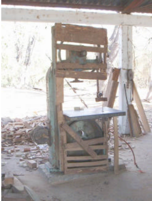
Bandsaw safety guards by Pallets Inc.