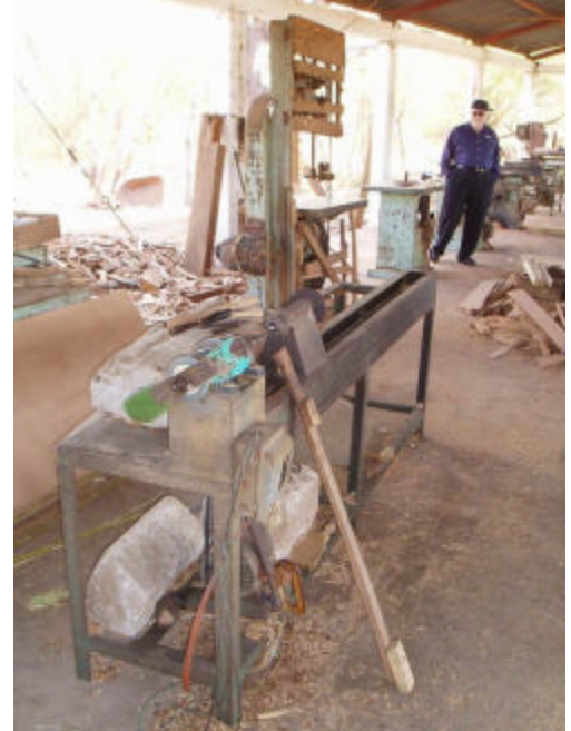
Mexican lathe showing ouboard dust control accessory and Universal Infinitely Controlled tool rest in position. Note also environmentally friendly vibration damping system.